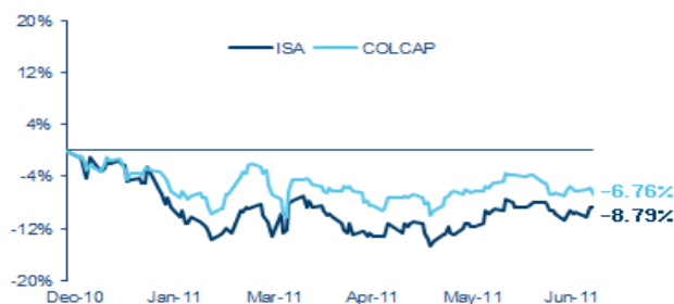
ISA CB – Colombia Stock Exchange