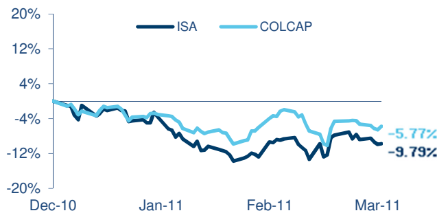
ISA CB – Colombia Stock Exchange